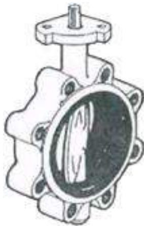
Table 1 Part List

NOTE: Valve cannot be operated without position plate or gear operator bolted in place on valve body